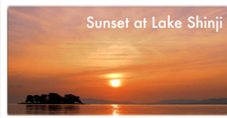
Sunset at Lake Shinji

Coincidentally, the annual two-day Matsue Fireworks display will be held the weekend right after the conference. This is a huge event in Matsue with a total of 9000 skyrockets fired. Participants who are continuing their stay after the conference are encouraged to enjoy the annual Matsue Fireworks display by Lake Shinji.